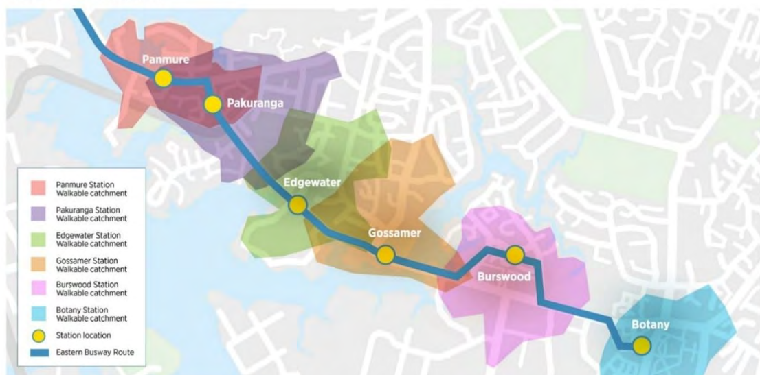
Figure 2: Eastern Busway map, features and proposed alignment from Pakuranga to Botany